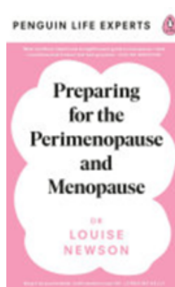
Preparing for the Perimenopause and menopause