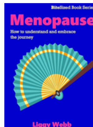
Menopause: How to understand and embrace the journey